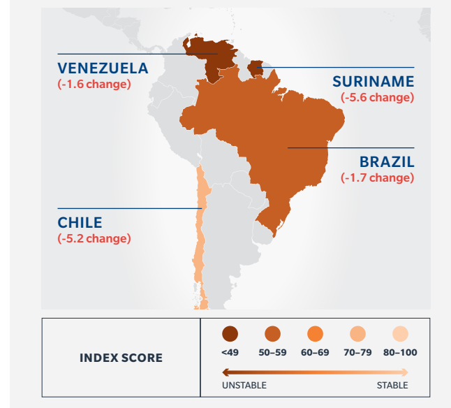
FIGURE 3 Key Short-term Political Risk Score Changes: Latin America Scores and observations from BMI Research

Several countries in the region are experiencing periods of unrest and economic austerity, which have had a negative impact on their political, economic, and country risk index (CRI) scores. The STPRI was reduced in both Venezuela, from 35.0 to 30.6, and Suriname, from 52.9 to 47.3. Political gridlock and rising unemployment has caused Chile's STPRI score to fall from 75.8 to 70.6. Meanwhile, Brazil's STPRI was reduced from 59.2 to 57.5 amid allegations of corruption surrounding President Michel Temer, however, on August 2 opposition lawmakers in the lower house of Congress failed to obtain the two-thirds majority needed to send the case to the Supreme Court. 3