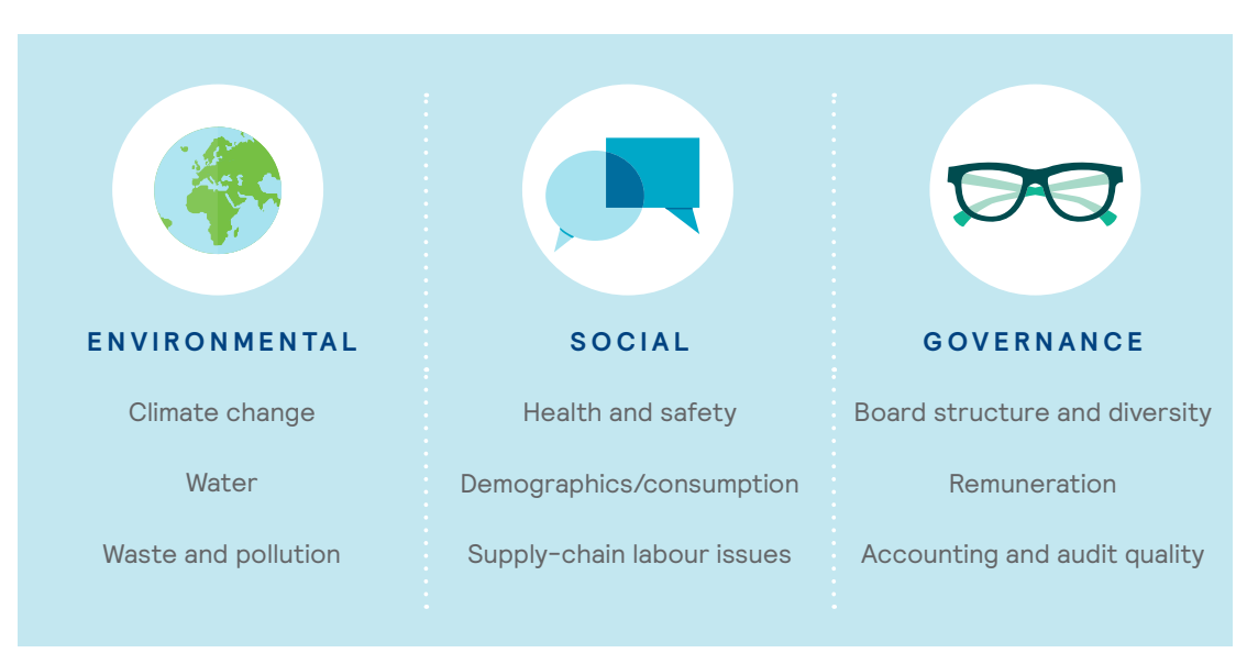
Table 1. ESG Factors

Selection and monitoring processes for potential and appointed sub-investment managers include Mercer's ESG Ratings and associated commentary from the Manager Research team (see Appendix for further detail). ESG Ratings are reviewed during quarterly monitoring processes, with a more comprehensive review performed annually — which seeks evidence of positive momentum on ESG integration. Expectations are set as ESG3 or above, where practicable and relevant to the strategy (with ESG1 being the highest rating and ESG4 being the lowest). Comparisons are also made with the appropriate universe of strategies in Mercer's global database.